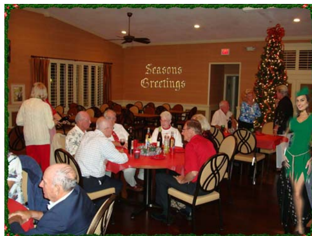
~ Fun & Great food at the 2011 Christmas Party ~