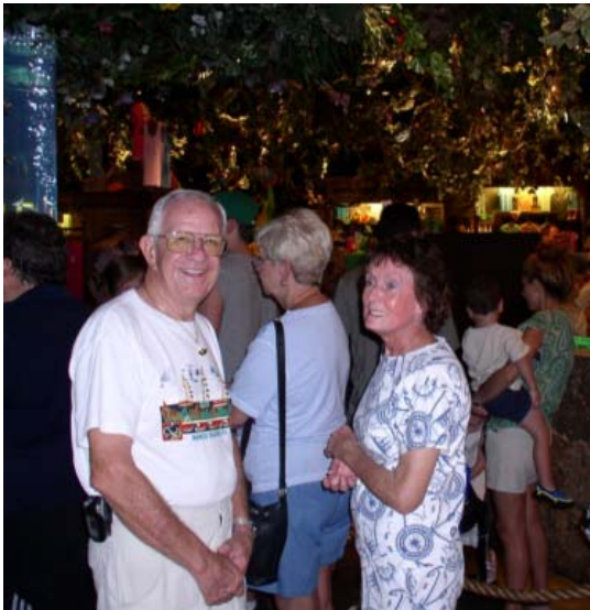
The Park by the lake in downtown Disney.